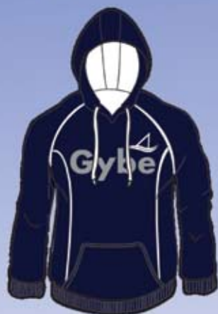
HOODIE Premium Cotton