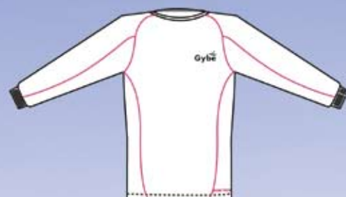
LONG SLEEVES TOP Gybe Tech