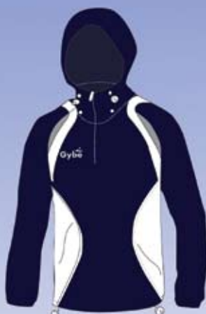
RAIN JACKET Premium Rip-Stop