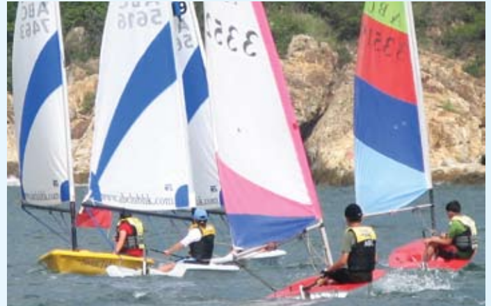
School Sailing Session

Club Dinghy Racing has also seen an upswing in participation, with our teams regularly racing and the formation of a brand new “Optimist” series running alongside our handicap series. Our sailors also compete in other clubs regattas, and for two years running we have entered all 6 of our Laser 2000s in the annual Around The Island Race. Perhaps the biggest indicator of our growing Dinghy presence has been participation in the ABC Opening Regatta, now with a completely separate Dinghy regatta, together with the brand new ABC South Side Regatta, held in December. This was the largest Dinghy event ever held by our club, with 92 entries in three divisions.