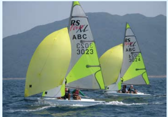
RS Feva Dinghies

With increasing numbers of students, additional resources were needed. 2008 saw the purchase of 6 brand new RS Feva intermediate training dinghies, and these have proved a very useful and popular addition to our fleet. They provide younger teenagers with a proper 2 person boat, capable of racing and exciting downwind Gennaker sailing. We also obtained a high performance RS500 dinghy, together with several second hand Toppers and Lasers to further increase our fleet. We were also lucky enough to buy, very cheaply, 6 Windsurf trainers, and with new smaller training rigs have launched regular Windsurf Introduction Courses. 2009 was the year of the Optimist! With a rapidly expanding Junior Sailing programme, ABC purchased additional training boats and also 9 top-range racing dinghies bringing our Optimist fleet to 23 boats! Of course with more courses and more activity, our Safety Boat fleet needed to expand, and we have now renovated one of our old RIBs to a high standard, and purchased 2 more second hand boats, together with a new "small" RIB, bringing our safety boat fleet to 5 vessels.