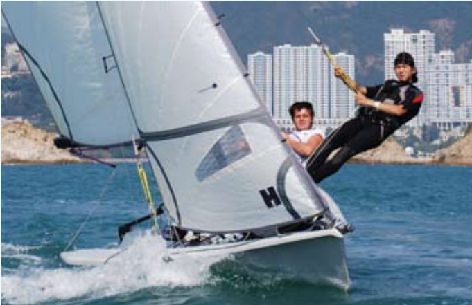
RS 500 Dinghy

Adult Dinghy Sailing has not been left out, but limitations of resources have meant that over the past 2 years priority has been put firmly with youth sailing. The most significant adult dinghy sailing initiative has been the introduction of two-day Laser 2000 Courses. These aim to follow on from our adult beginner courses as well as providing an opportunity for those who may need a refresher to get “back in a boat”. Since the first Laser 2000 Course, around 70 have participated and demand continues to grow.