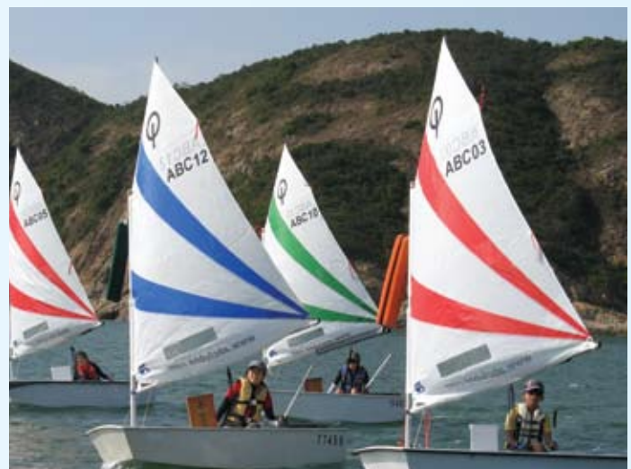
Optimist Training Dinghy

Apart from regular sailing courses, the formation of an "after-school sailing programme" also got under way in 2007. We now regularly work with 11 local schools, including our near neighbors Singapore and Canadian International. The short afternoon sessions bring many new students into contact with our club and feed into our regular sailing courses; last year saw 150 school students sailing at ABC.