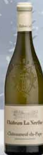
Chateau La Nerthe Chateauneuf du Pape Blanc 2019 Region: Rhone, France 750ML RP 91

Subtle scents of pencil shavings and toasted almonds accent lime and tangerine notes on the nose. It's a medium to full-bodied, generous wine that has enough structure to keep it refreshing on the long, citrusy finish.