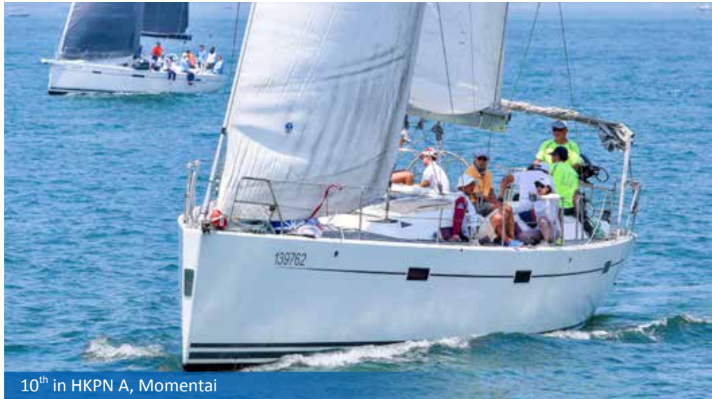
10 th in HKPN A, Momentai

Wind strength? A little light, but enough to get everyone on their way. Wind direction? From the southwest, which would allow a nice reach to Bluff Head. The finish would be off Middle Island with a provision, in the sailing instructions, to shorten at Castle Rock, if the wind died.