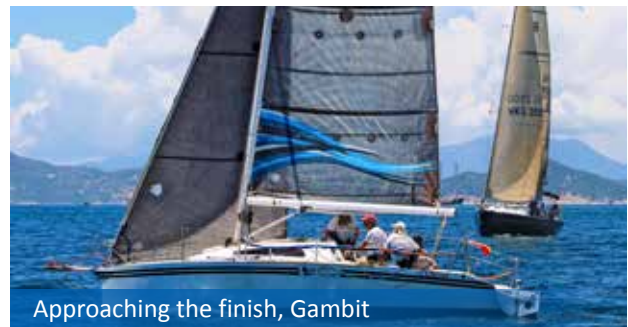
Approaching the finish, Gambit