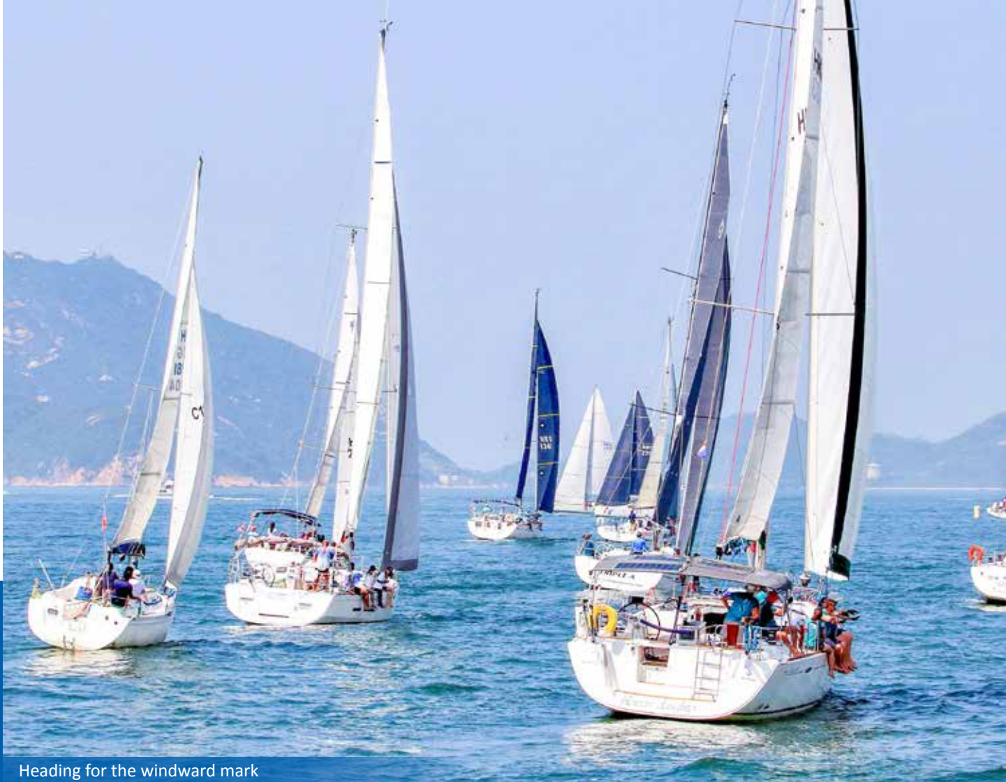
Heading for the windward mark