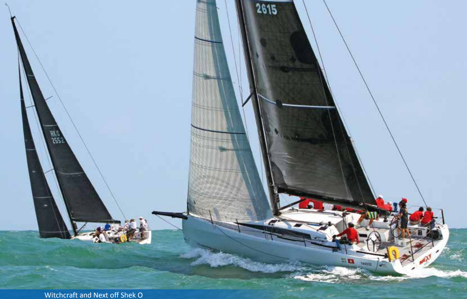
Witchcraft and Next off Shek O

Ten minutes later, at 1050, an orange flag and gun let the 19 assembled boats know that racing was about to begin. At 1055 the countdown began for IRC and at 1100 a gun saw a lively start with Intrigue , Next and Witchcraft leading the fleet. Ding Dong , too, made its mark nearer the committee boat. All 12 boats clear and heading for the windward mark set in towards Repulse Bay.