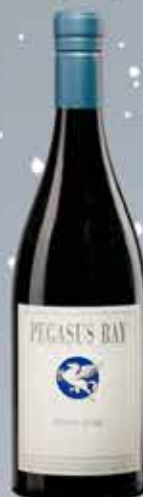
Pegasus Bay Pinot Noir 2019 Region: Waipara, New Zealand. 750ML BC 95 JS 96

Dark berry, cassis, violet, mixed spice, new leather and spicy oak flavours supported by firm, ripe tannins.