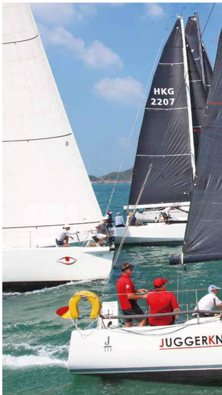
Juggerknot has an ordered start