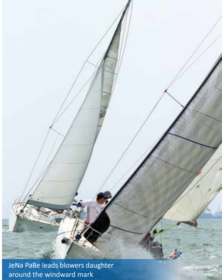
JeNa PaBe leads blowers daughter around the windward mark

Five minutes later the four HKPN A boats and five HKPN B boats followed, including Shun Shui and Easy Breezy II , with XT and Scintilla in HKPN A, and Shun Shui in HKPN B amongst the leaders.