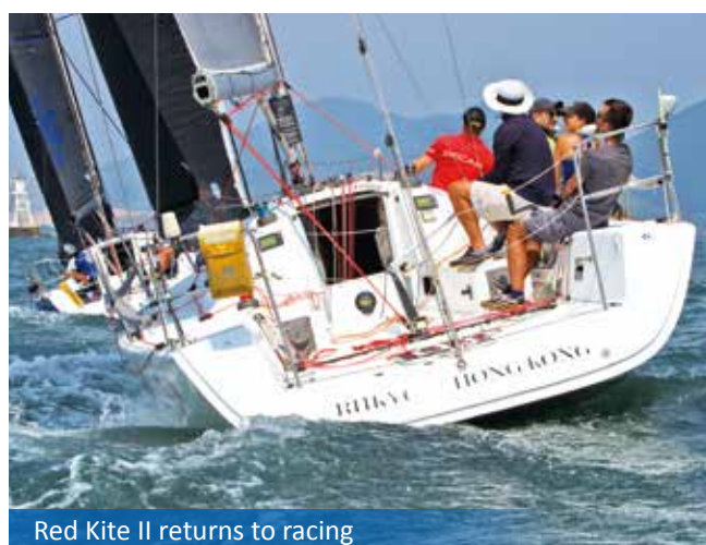
Red Kite II returns to racing