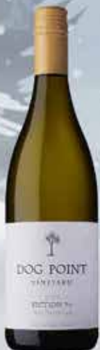
Dog Point Sauvignon Blanc Section 94 2016 Region: Marlborough, New Zealand 750ML RP 92+

A complex full-bodied style of Sauvignon Blanc with a chalky minerality and fresh herbal influence, complimented by a vibrant acidity which gives the wine focus.