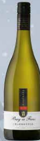
Bay Of Fires Chardonnay 2020 Region: Tasmania, Australia 750ML

With aromas of spice, fresh white peach and lemon zest. A hint of toasty oak and a note of lemon curd when at young. The flavours of stone fruit and grapefruit mix well with a creamy mouthfeel that adds wonderful complexity