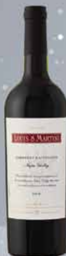
Louis M Martini Napa Valley Cabernet Sauvignon 2018 Region: Napa Valley, USA 750ML JS 93

This wine delivers flavors of blackberry, cherry, dark chocolate and graham cracker that make for approachable experience.