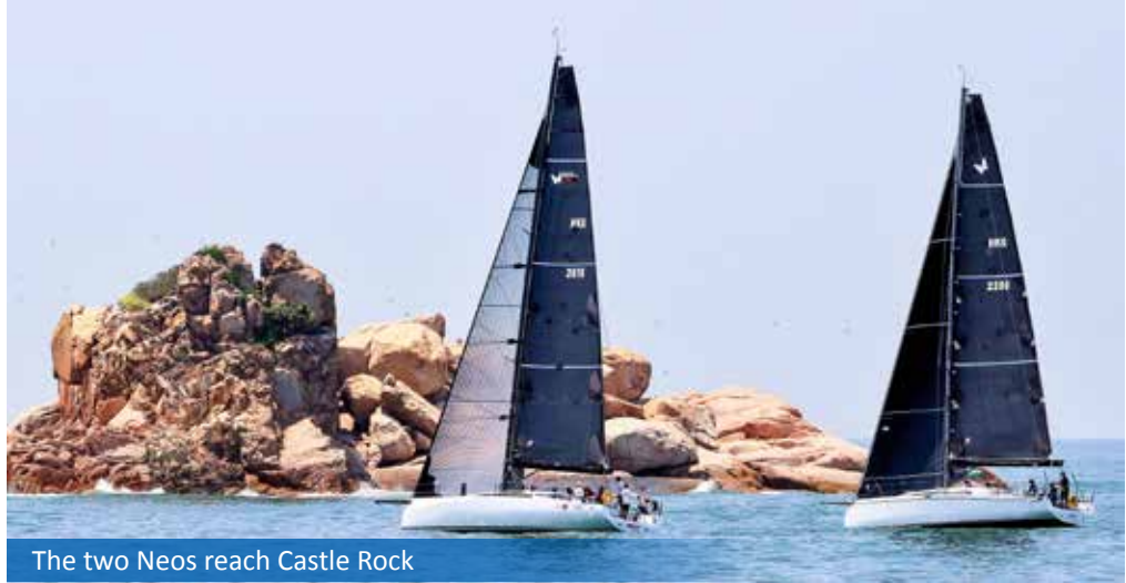
The two Neos reach Castle Rock