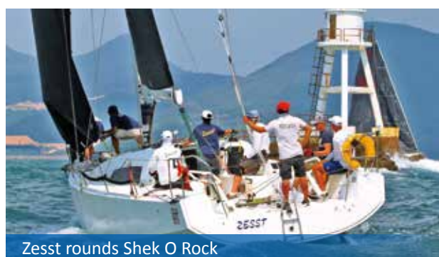
Zesst rounds Shek O Rock