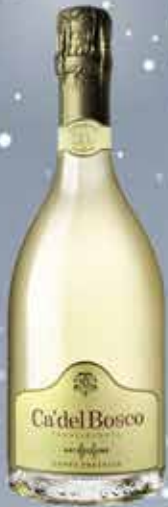
Ca'del Bosco Cuvee Prestige Edizione 44 Region: Lombardia, Italy 750ML

Juicy array of peaches, melon, lemons and pear blossom with honey and biscuit undertones. Light to medium body with crisp acidity and fine bubbles.