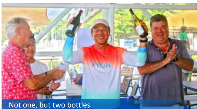
Not one, but two bottles