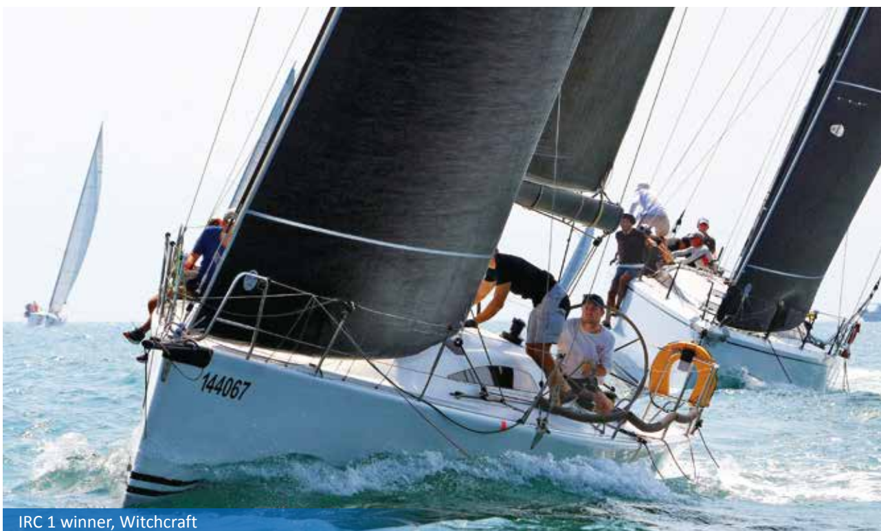
IRC 1 winner, Witchcraft

The next race in the Waglan Series, Race 2, is scheduled for Sunday, the 23 rd of October 2022.