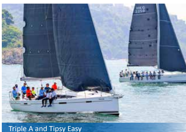
Triple A and Topsy Easy