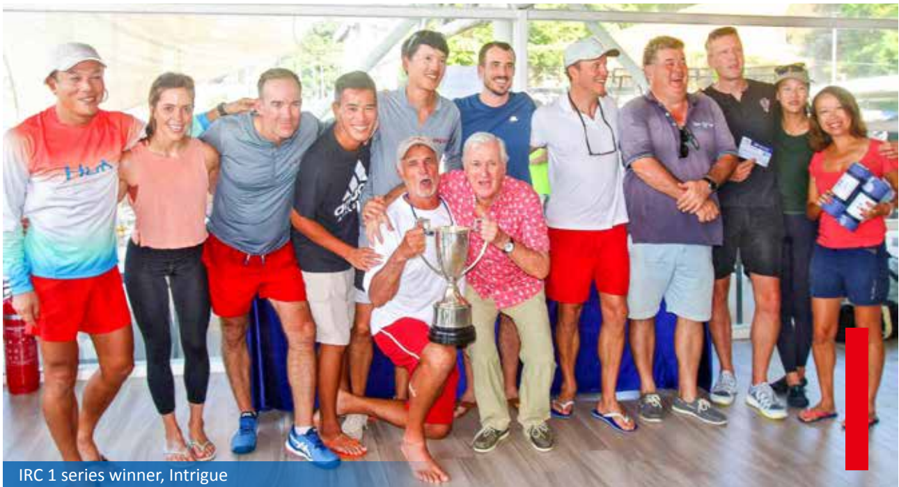
IRC 1 series winner, Intrigue