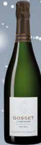
Gosset Cuvee Extra Brut Region: Champagne, France 750ML RP 91

The nose is very precise, mixing fragrances of white flowers like acacia, hawthorn with flavoursome notes of pear. The palate with notes of juicy fruit and delicate flowers, with a crisp minerality.