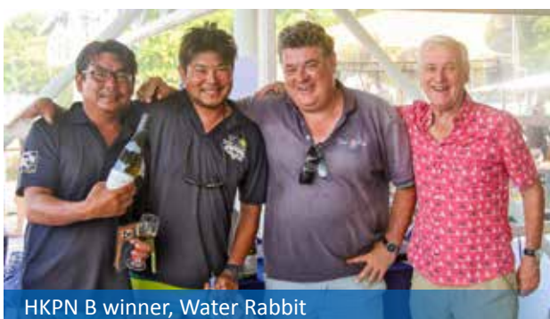
HKPN B winner, Water Rabbit