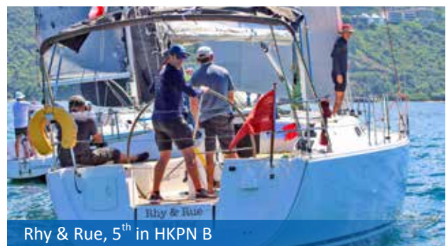
Rhy & Rue, 5 th in HKPN B