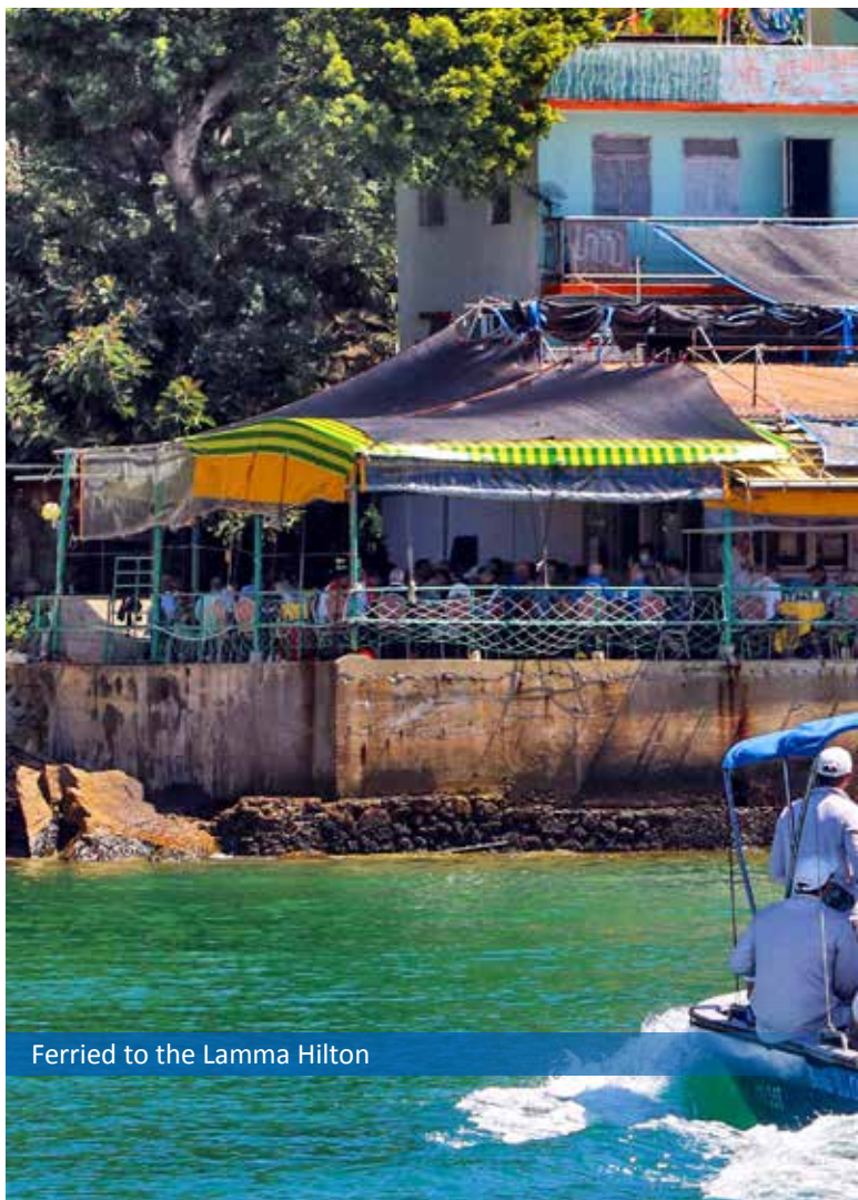
Ferried to the Lamma Hilton