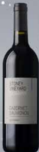
Stoney Vineyard Cabernet Sauvignon 2017 Region: Tasmania, Australia 750ML JH 93

It begins with plenty of dark fruit and a flashing herbaceousness, currants and blueberries. The length is solid and layers nicely with time. Oak texture is fine and well integrated.