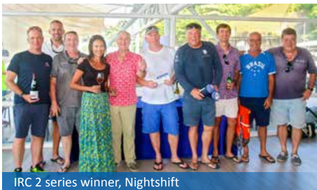
IRC 2 series winner, Nightshift