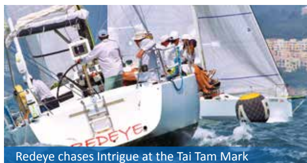
Redeye chases Intrigue at the Tai Tam Mark