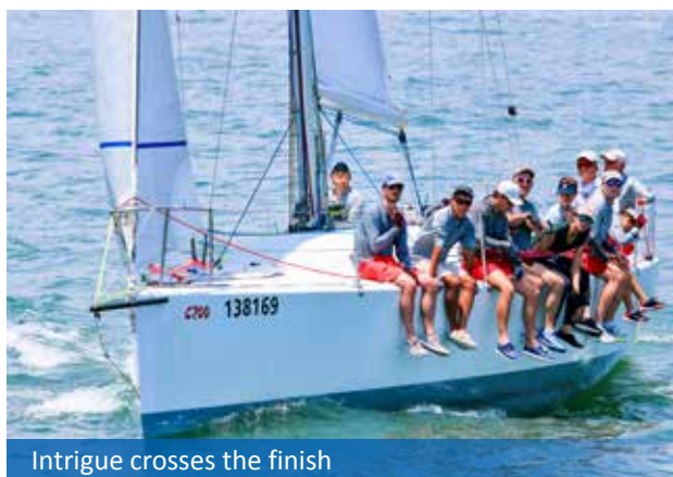
Intrigue crosses the finish