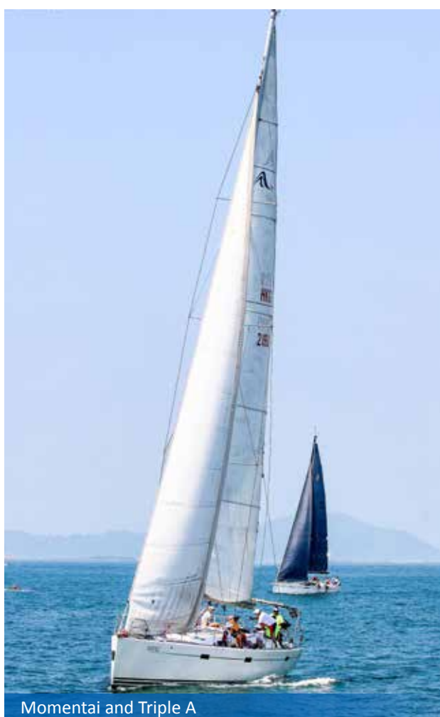
Momentai and Triple A