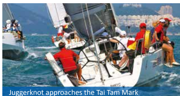
Juggerknot approaches the Tai Tam Mark