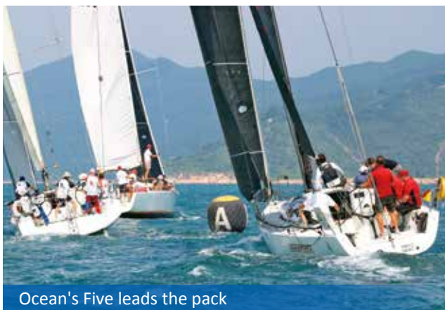
Ocean's Five leads the pack