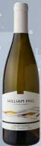
William Hill Napa Valley Chardonnay 2020 Region: Napa Valley, USA 750ML

Aromas of ripe Anjou pear and creme brulee complement layers of ripe peach, golden apple and lemon shortbread on the palate. The velvety mouthfeel is balanced by bright acidity that carries through a fresh finish with a hint of spice.