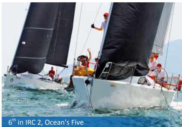
6 th in IRC 2, Ocean's Five

The slower boats went through the Chesterman Gate, left Castle Rock to port, into the Beaufort Channel (Sheung Sze Mun) and on to Fury Rocks (s), back through the Po Toi Channel (Lo Chau Mun), rounding Castle Rock, through Chesterman Gate and on to the committee boat stationed off Round Island.