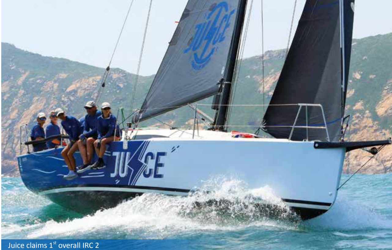
Juice claims 1 st overall IRC 2